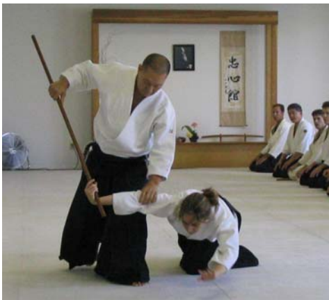
Western States Camp.

Toyoda Sensei always lived bigger than life, and what he accomplished in such a short time is beyond measure.