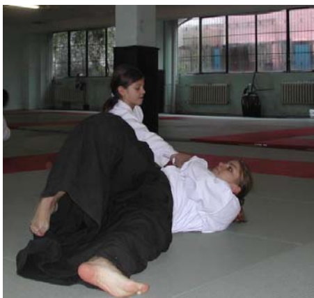
Bulgarian Instructors and Winter Seminars.

I was always astonished how pleasant is this feeling of intimacy between the people from different dojo, even from different countries. Probably this is one of the magic things of Aikido – to draw people together independently of their countries or ages. The essence of the instructor's seminar makes this feeling grow and at the same time makes you think of one point – will you be able to give the people your knowledge in an appropriate way, will you be able to fire this spark to practice Aikido as your teachers have done for you and continue to do this?