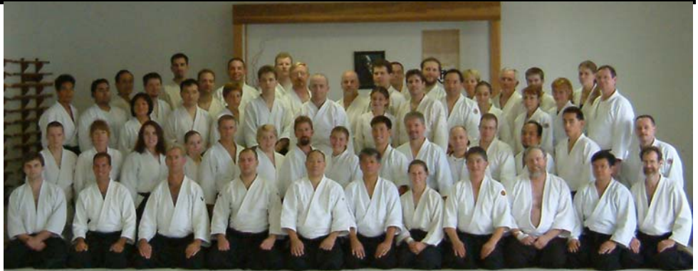
Western States Camp.

I arrived Friday morning, just in time to catch the tail end of Andrew Sato Sensei's demonstration. The seminar actually started Thursday evening, but I was unable to make it. There were about 80 people registered for the seminar, and that left only enough room to form lines for all of us to practice. One person as nage, per line, and the rest of us lined up