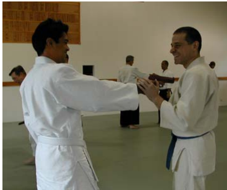
AIF Guest Instructors Seminar.

Our answer is always the same, "Yes, in time and with study you will have the skills necessary to defend yourself." Then their training begins. They come with more questions and conceptions about what they are about to do. And like