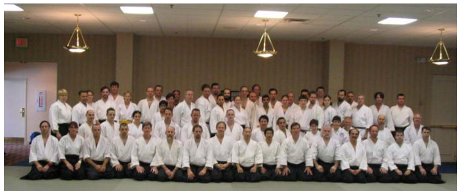
Georgia Seminar.