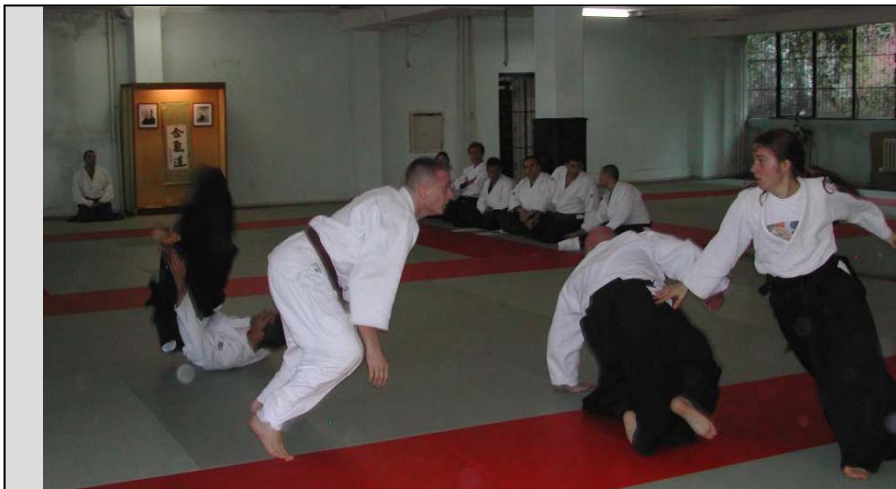
Bulgarian Instructors and Winter Seminars.