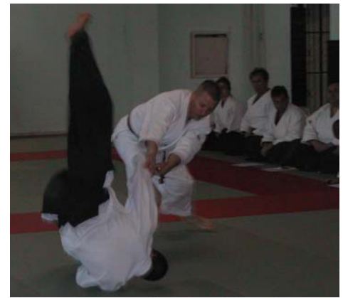
Bulgarian Instructors and Winter Seminars.

The last day consisted of two more training sessions. Sato Sensei put "the cherry on the top of the ice cream" by