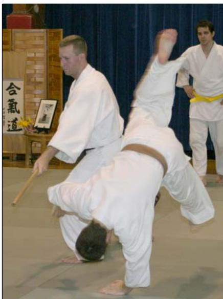
Eastern States Camp.