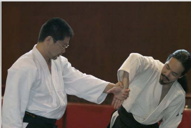
Eastern States Camp.

Eastern States Camp... (Continued from page 4)