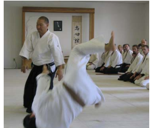
Western States Camp.