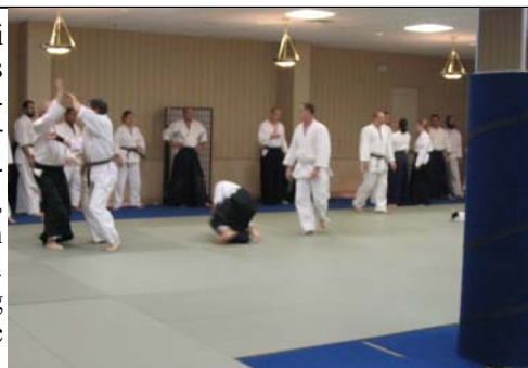
Georgia Seminar.

Kyushinkan Dojo, the local AAA affiliate hosted the event, putting in a lot of behind the scene effort and running it seamlessly. One unintended side-effect of laying mats on the meeting room carpet was discovered Friday night when they were seen to drift apart rather ran-