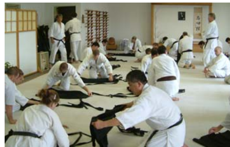
Western States Camp.

We bowed out for the evening for a little dinner, rest, relaxation, and ibuprofen. When I woke the next morning I found that I had muscles screaming at me that I never imagined existed.