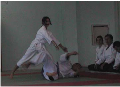
Bulgarian Instructors and Winter Seminars.