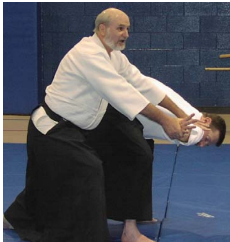
AAA Southern Region Teaching Committee Seminar.

both empty-handed and with weapons, consummate tactical skills, and physical endurance in randori, and she was the embodiment of grace in all her movements.