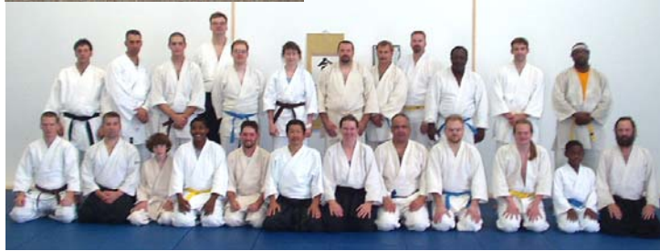
AAA Indiana Teaching Committee Seminar.