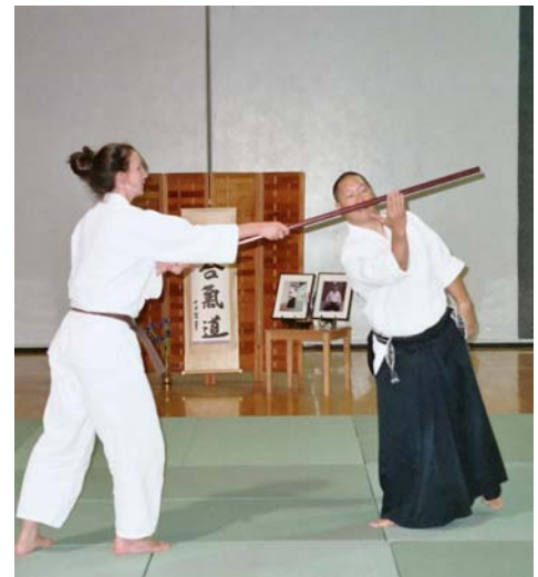
Northeast Memorial Seminar.

The seminar concluded and people departed in the usual manner. However, the feeling was notably different. There was a sense of renewed commitment to the art, to the organization, to our teachers, and to each other; that the lessons that we have been so blessed to have experienced must be passed on! However, after everyone had gone their separate ways, there was another feeling that