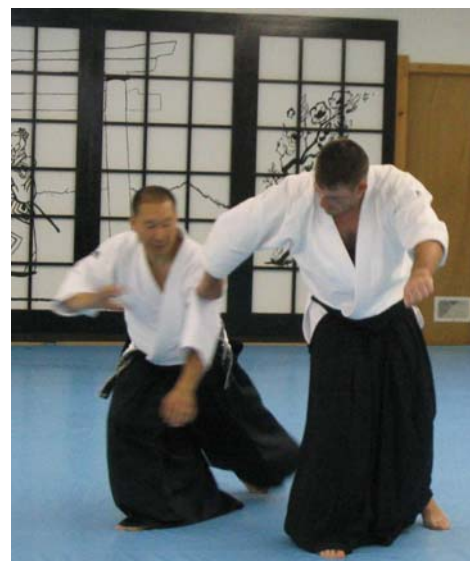
Ohio Seminar.

sense has impact outside of the dojo. Everyone has bad days at work, and most would agree that environments tend toward being stressful and combative. Realizing that those around me at work are also trying to sincerely make their way gives me the peace of mind to find un-