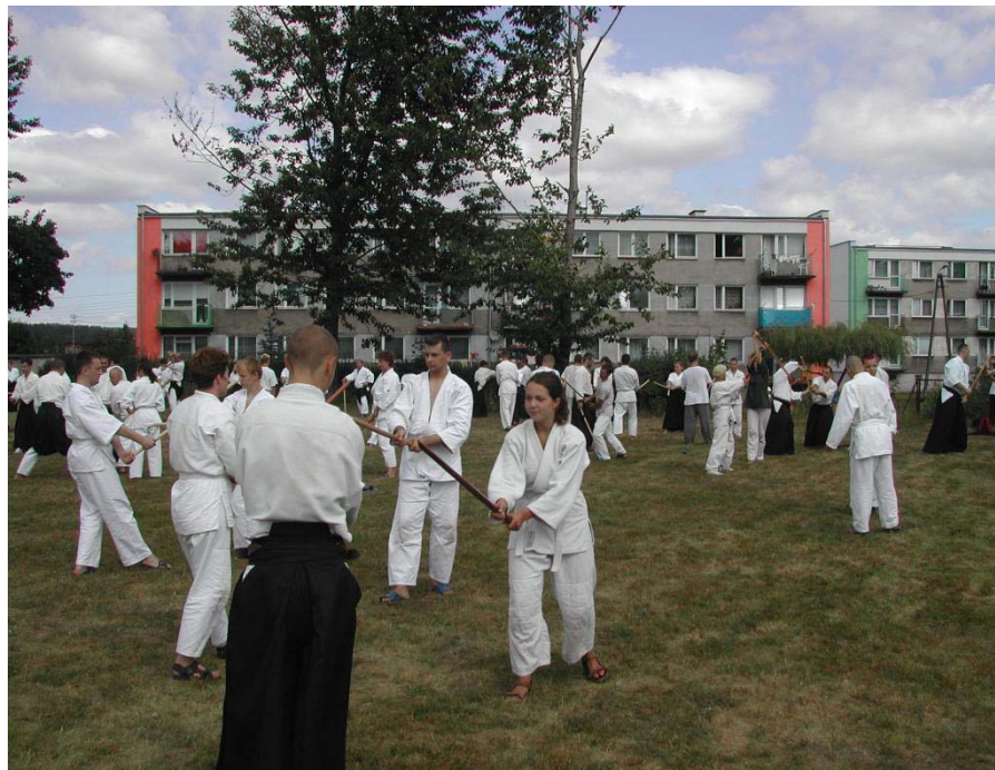
Bokken training outside during the Poland Summer Camp. Below: Group photo at the Poland Summer Camp.