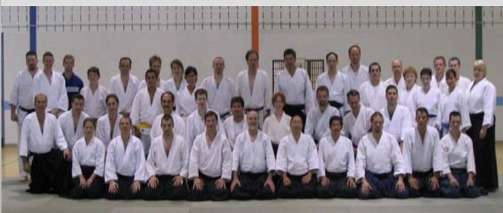
Group photo at Southern Region Camp.