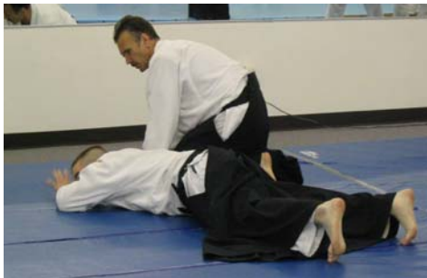
Ohio Seminar.

Ohio Seminar... (Continued from page 13)