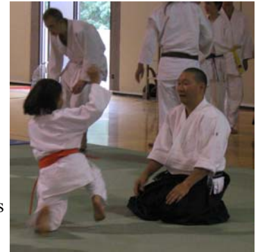
Northeast Memorial Seminar.