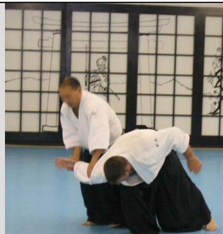
Ohio Seminar.

You may be thinking, why is that so important, what difference does that make? To understand the answers to these questions you must understand the connection we all have as Aikido students. In my opinion, all AAA students look to the source for direction and teaching as our students and instructors do. However, this source sometimes seems so far away being based in Chi-