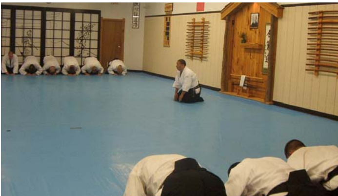
Ohio Seminar.