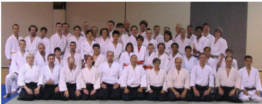
Group photo at Northeast Memorial Seminar.