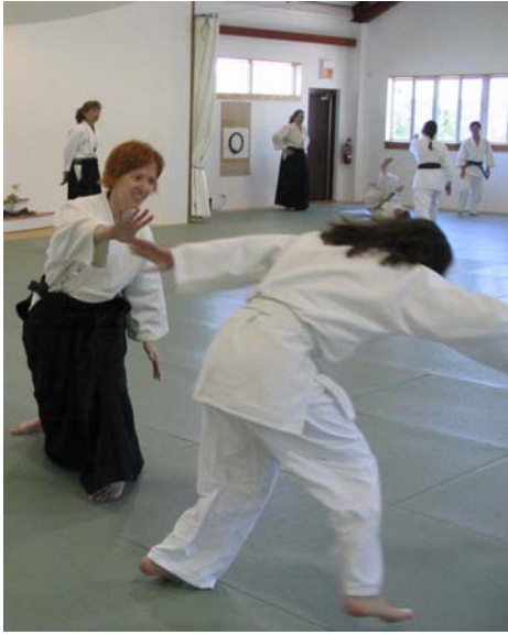
AAA Women's Seminar.

comfortable making mistakes and didn't feel as intimidated to really open themselves up to techniques. Several people commented that our kiais were higher pitched and that the phrase, "I'm sorry," was heard more often, but none of these defined it as a women's seminar. What defined it was our desire to come together and address gender issues in a safe forum.