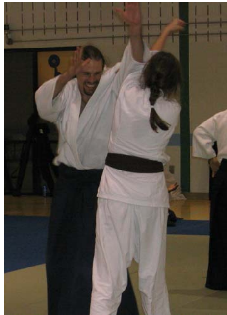
Clockwise from top left: Central Region Camp, Central Region Camp, Southern Region Camp, Southern Region Camp, Central Region Camp, Central Region Camp.