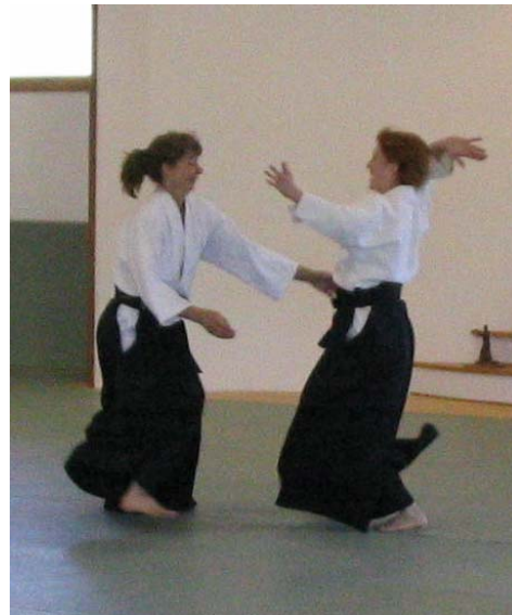
AAA Women's Seminar.

There was a short discussion about sexual issues in a dojo. If a woman comes into a mostly male dojo she may feel intimidated if she is "hit-on" by fellow Aikidoka. That new student may quit because she has come to train, not to find a boyfriend. Women (and men) need to feel safe, both emotionally and physically, in the dojo, and that has to