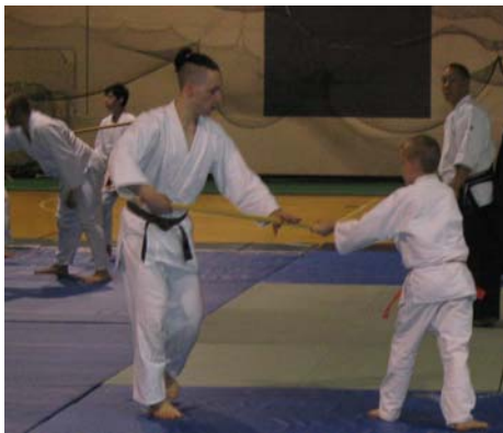
Northeast Memorial Seminar.

With the room full of energy and ki from the inspirational ceremony, training began. The seminar was focused on kihon waza. Beginning with tai sabaki movements and progressing into basic technique, Sato Sensei showed the clear teaching methodology and transmission of Aikido technique that Toyoda Shihan developed. Students of all levels, from children to adults and from beginning to dan ranking students, were able to practice with sincerity and intensity. As attendance at the seminar was at an all-