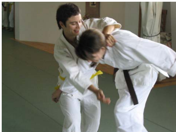
AAA Women's Seminar.