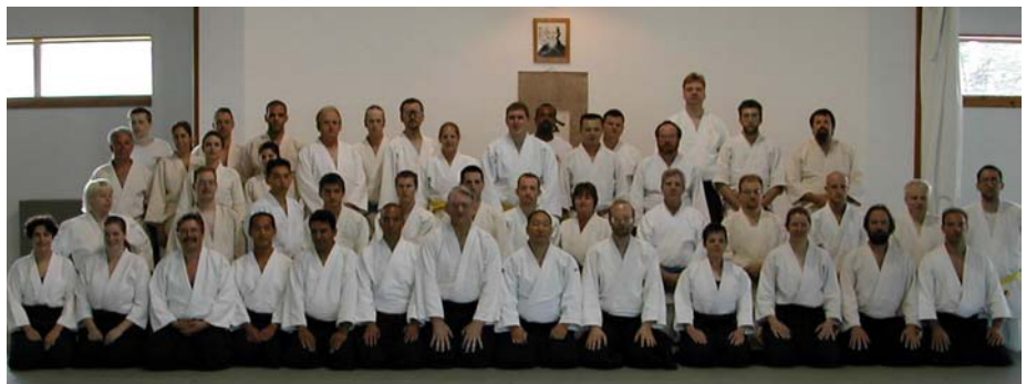
Group photo at Central Region Summer Camp.