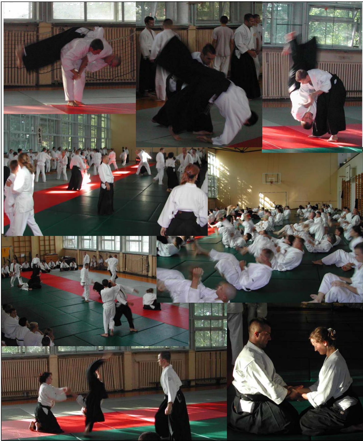
Photos from Poland Summer Camp, kyu tests and dan tests.