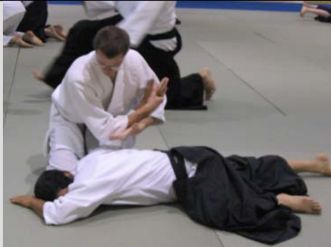
Southern Region Camp.

After checking into the hotel, we headed over to the Atlanta Area School for the