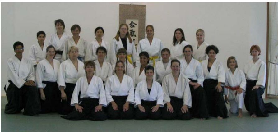
Group photo at AAA Women's Seminar.

to mind; within our organization and within many dojo women are a minority, there are gender differences in training and there are issues of sexual harassment and/or dominance that women may not feel comfortable voicing to a mixed gender crowd. We don't want to be separate from our male partners, but we do have different issues that can most effectively be addressed by training and talking to other women.